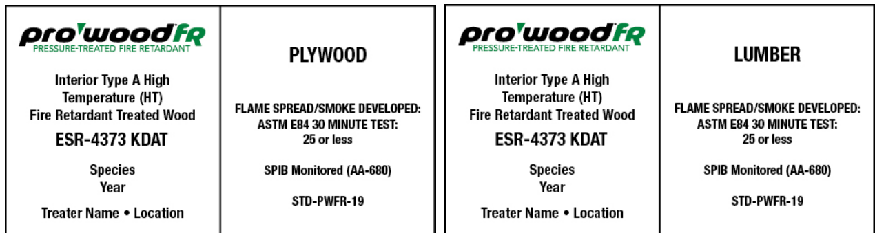
FIGURE 1—LUMBER AND PLYWOOD STAMPS